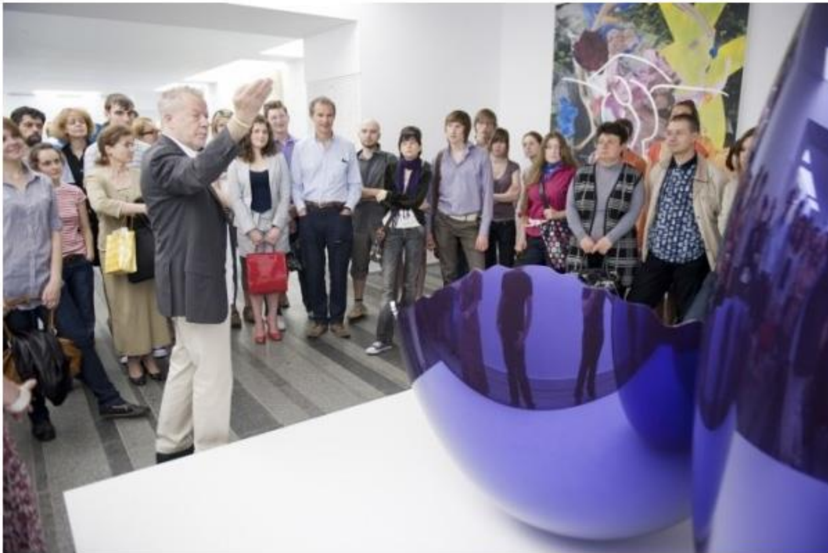
Meeting visitors near "Cracked egg" by Jeff Koons