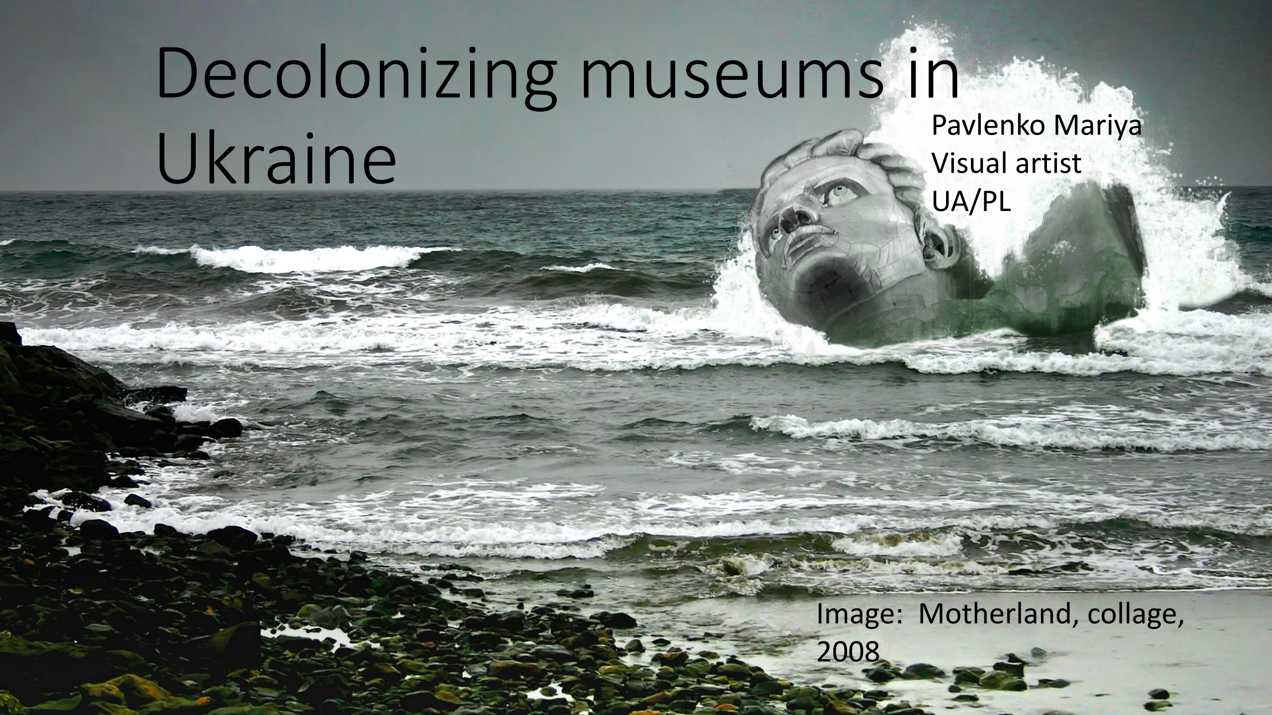
Image: Motherland, collage, 2008